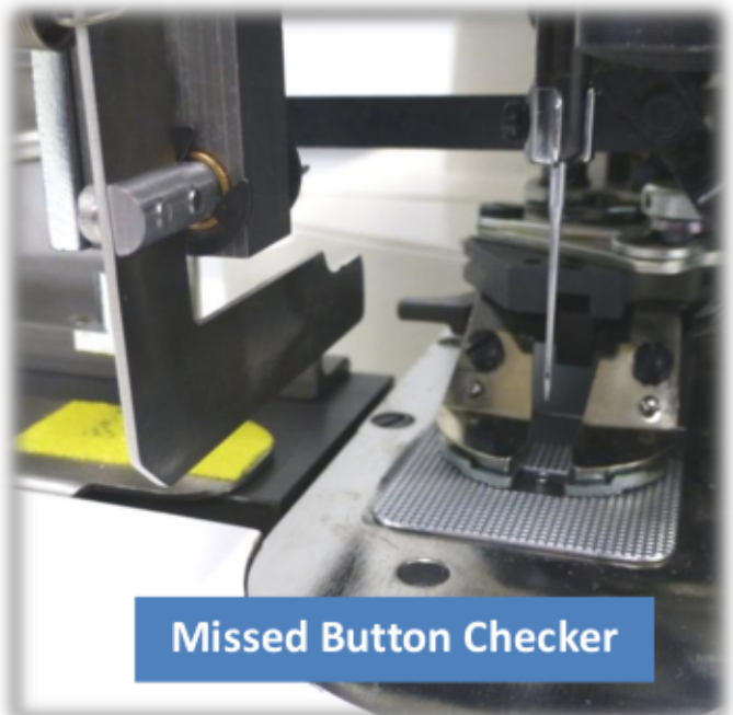
Missed Button Checker