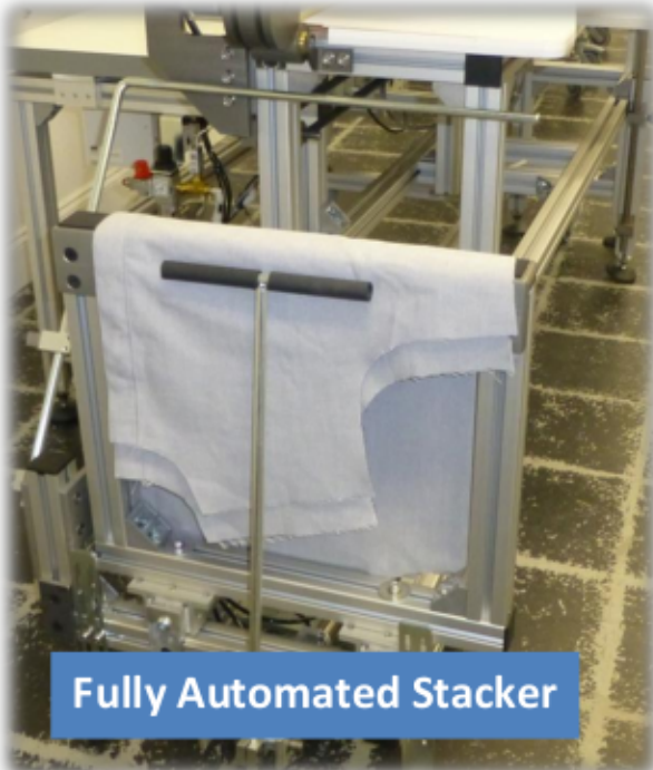
Fully Automated Stacker