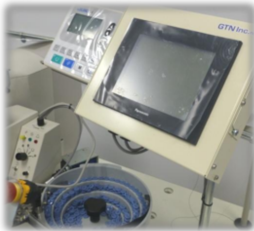
Operator Friendly & Moveable