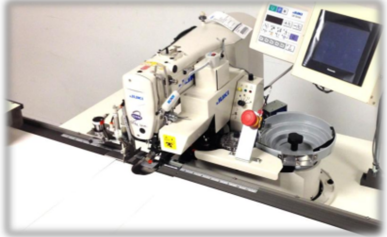
JUKI Machine LK1903B/BR35