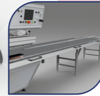
Manual table option