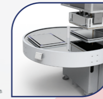
Rotating table option